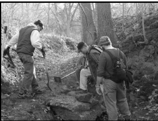
Trail Work at Platte River State Park—December 18, 2001